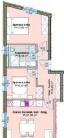
TLOCRT U MJERILU 1:100