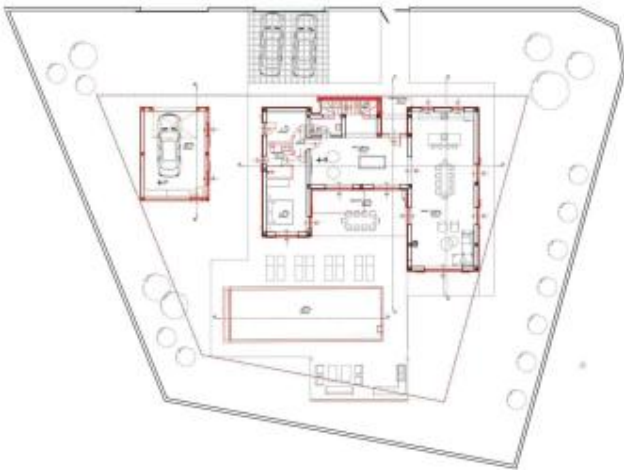
TLOCRT PRIZEMLIK M 1:50