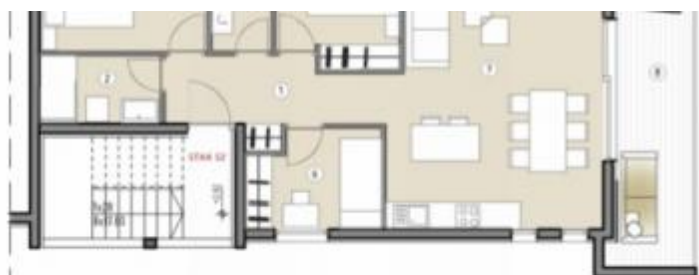
TLOCRT KROVNIH PLOHA