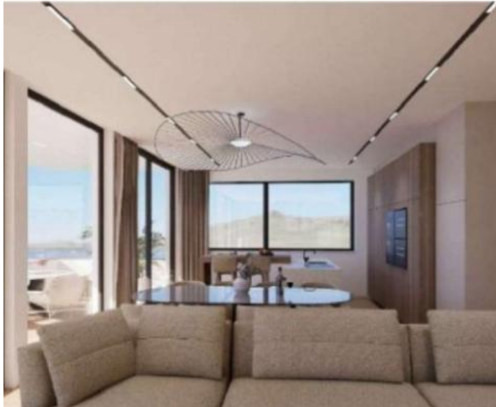
PENTHOUSE 2ND FLOOR LAYOUT BARBIR RESIDENCES SUKOŠAN