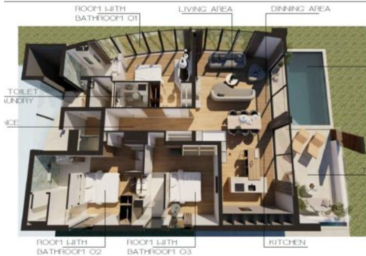
APARTMENT 02 FIRST FLOOR LAYOUT BARBIR RESIDENCES SUKOŠAN