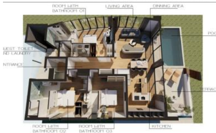
APARTMENT 02 FIRST FLOOR LAYOUT BARBIR RESIDENCES SUKOŠAN