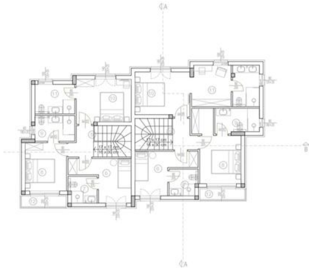
TLOCRT 1, KATA M 1_100