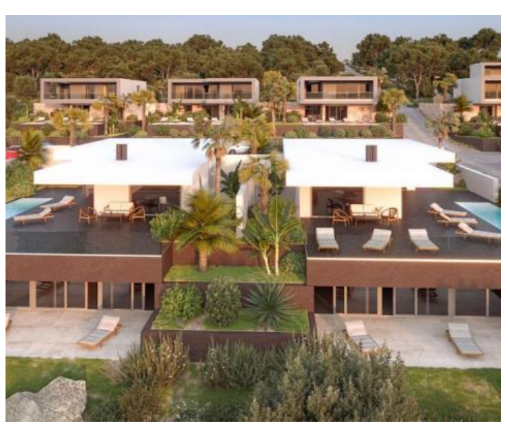
A - SUTEREN