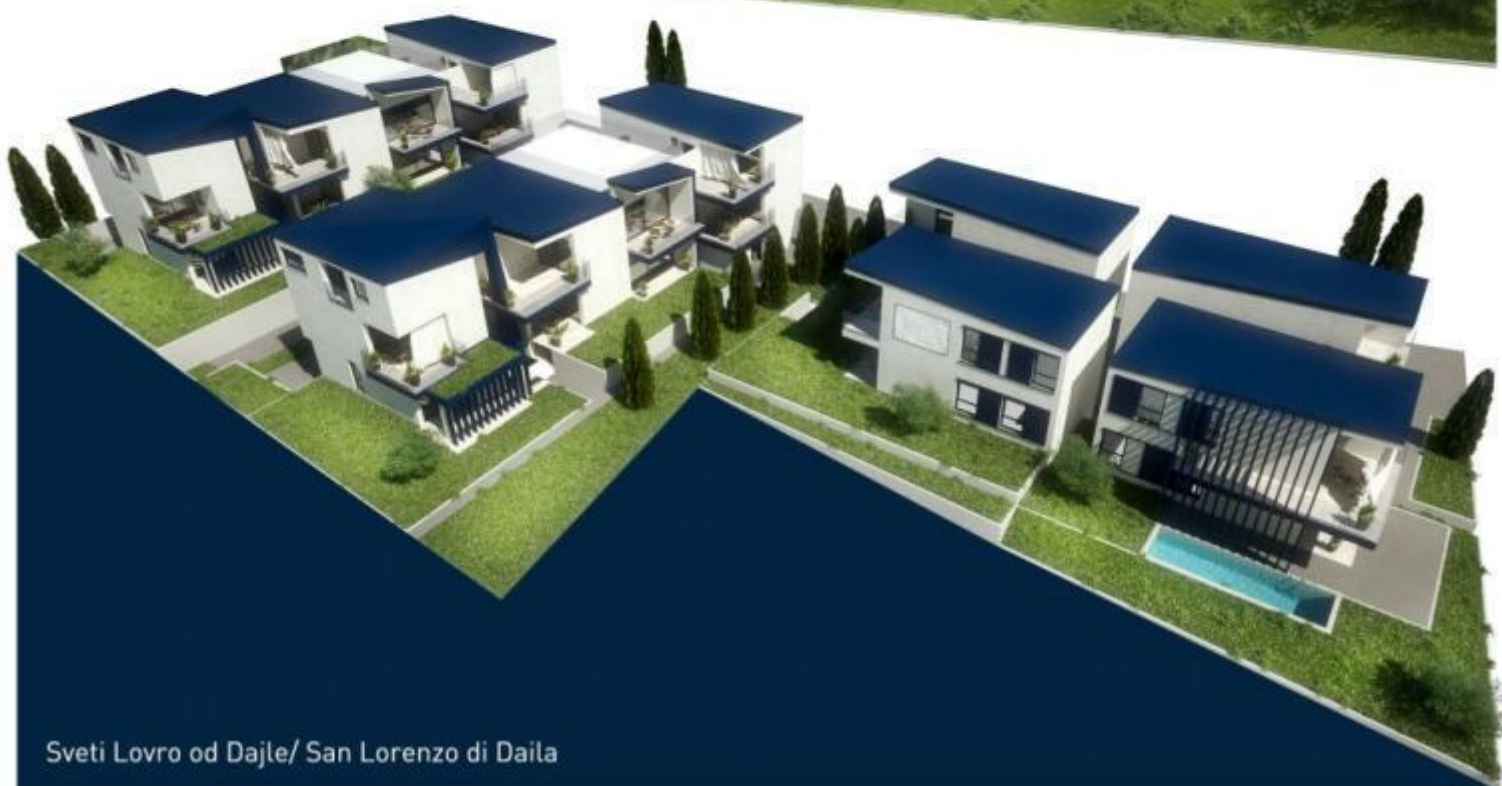
Sveti Lovro od Dajle/ San Lorenzo di Daila